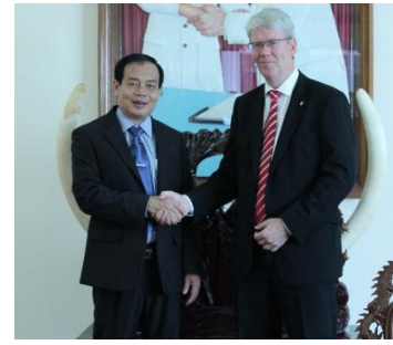
The two leaders