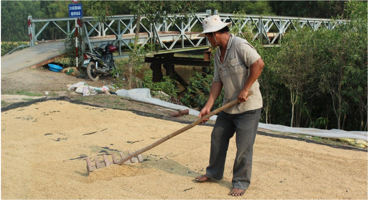
In Phu Tan there is already a site for a pilot plant.