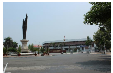
Rice straw statue in front of the Town Hall in Long Xuyen