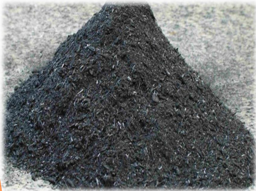
Rice husk ash