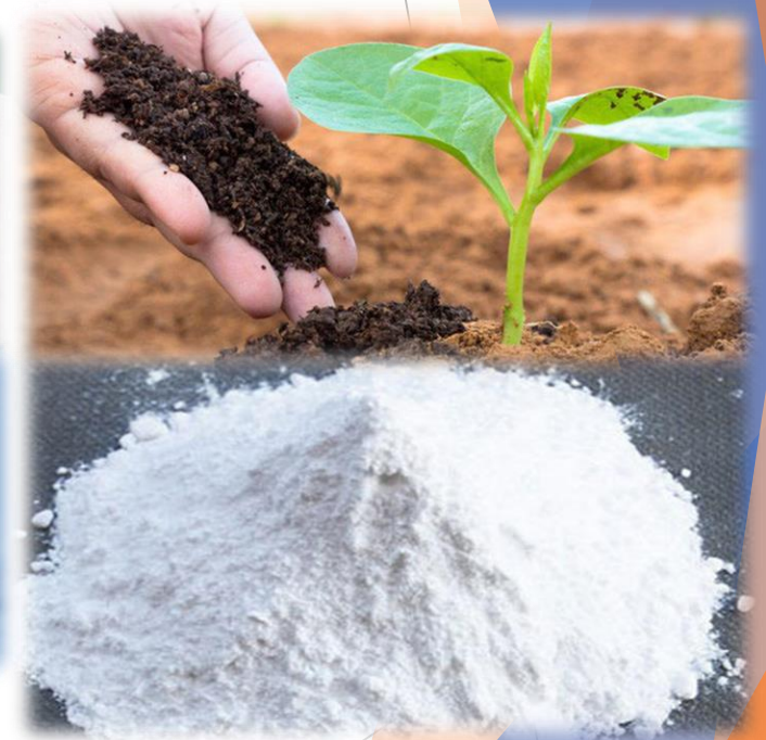
Fertilizer; Silica powder