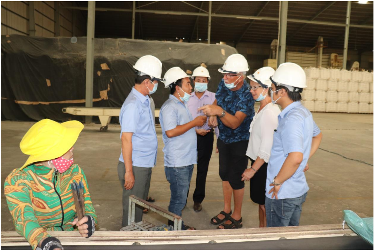
● Visited An Giang BioTech center